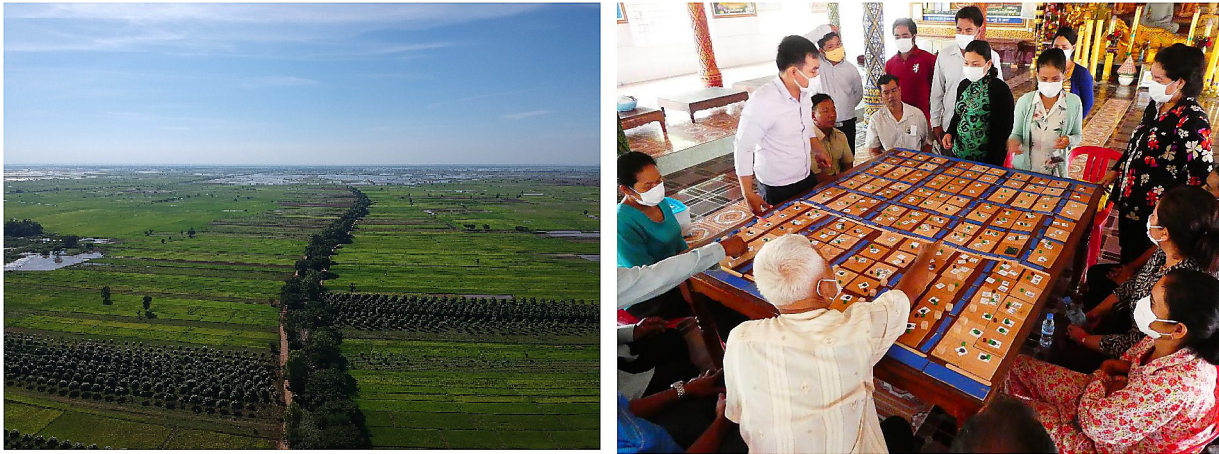
Fig. 1. A prek in the mosaic landscape of in Kandal (left) and discussion around a serious game , Kandal province, August 2020 (right).

Participatory critics might well reply that these precautions are not sufficient to immunize serious games against charges of depoliticization. After all, there are still implicit, framing assumptions, the games still simplify complex problems, and they render those problems technical in many ways. For example, although participants are given room to question and even modify game design (Daré & Barreateau 2003; Patamadit & Bousquet 2005), it happens against a backdrop of ideas, rules, and more or less explicit objectives defined by researchers or development experts during preparatory workshops where the participants are often absent.